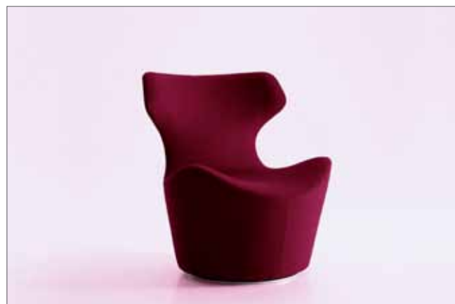
Piccola Papilio, design Naoto Fukasawa - B&B Italia