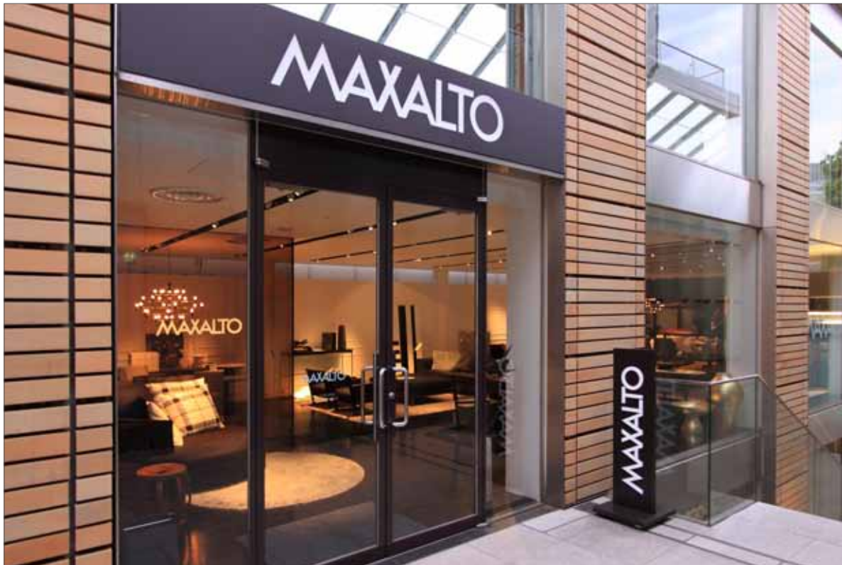
Maxalto Store Tokyo