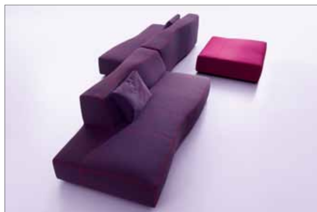
Bend Sofa, design Patricia Urquiola - B&B Italia

309 West Superior Street 60654 Chicago, IL