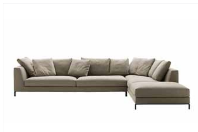
Ray, design Antonio Citterio - B&B Italia