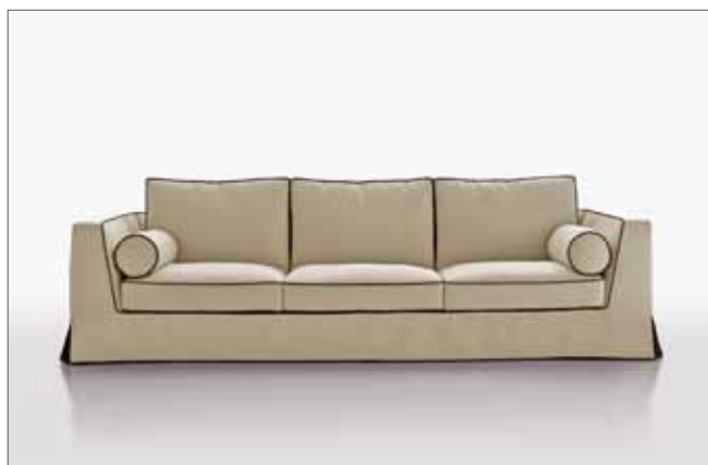
Lutetia, design Antonio Citterio - Maxalto