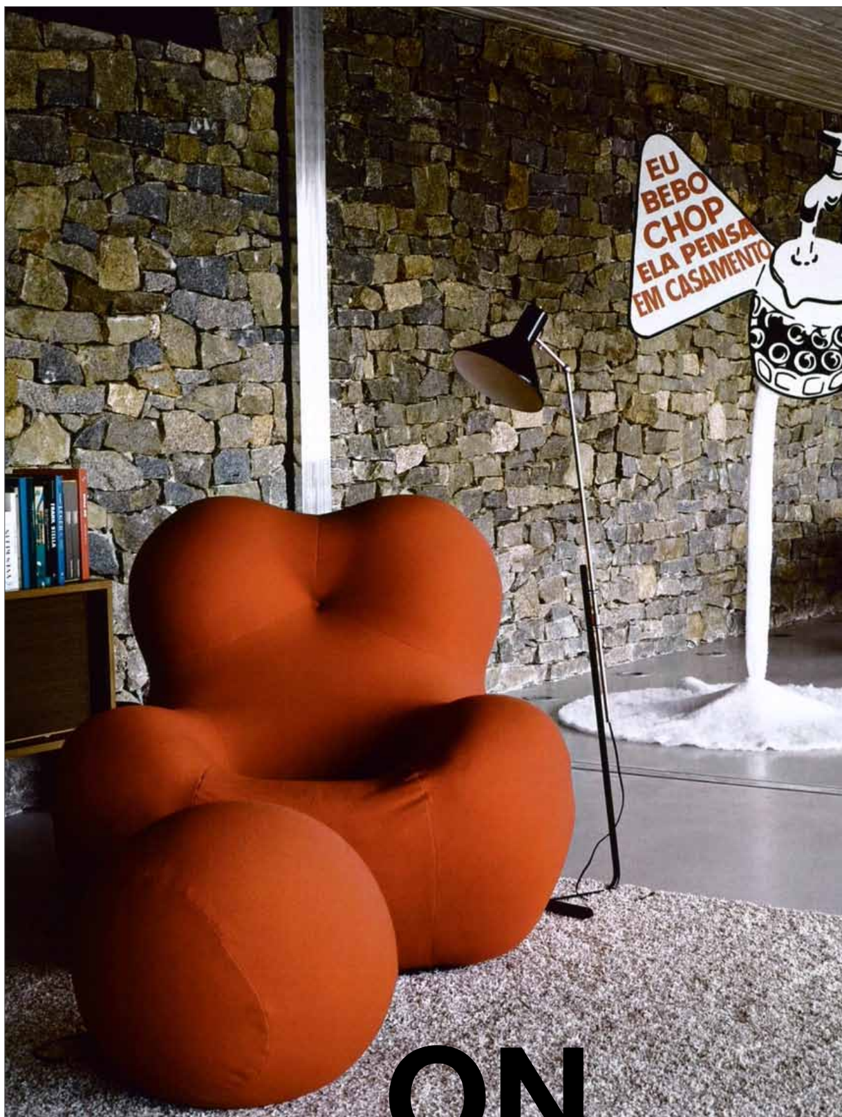
Elle Decor_Italia_maggio 2010